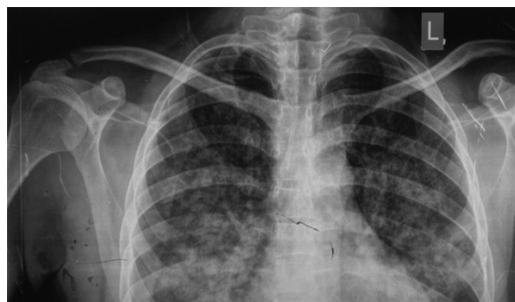
Figure 1: Chest radiograph showing bilateral perihilar alveolar shadowing extending to peripheral lung zones.