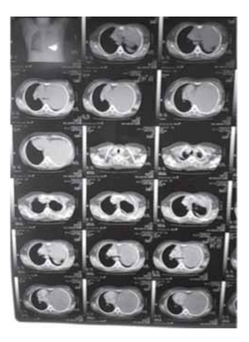
Figure B. CT chest with iv contrast showing soft tissue density mildly enhancing mass lesion taking most of the left hemi thorax.